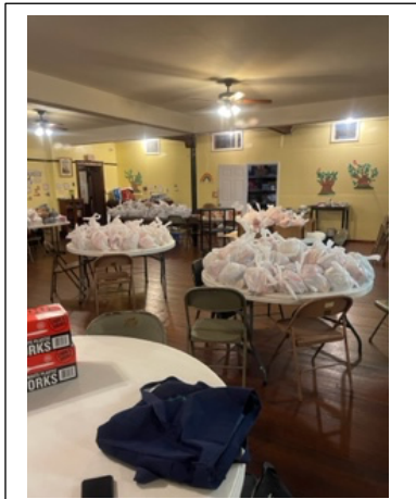
Individual Supply Bags ready to go!

Thank you for the wonderful gifts of food in recent weeks; let’s keep it up!